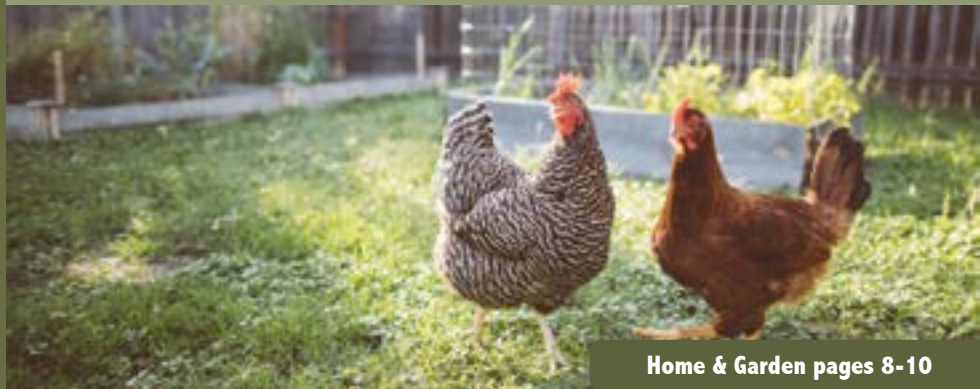
Home &amp; Garden pages 8-10