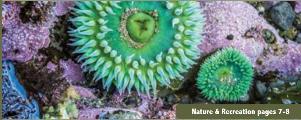
Nature &amp; Recreation pages 7-8

To view WCC's Student Conduct & Community Standards and the Student Rights & Responsibilities Policy, visit whatcom.edu/student-services/student-conduct .