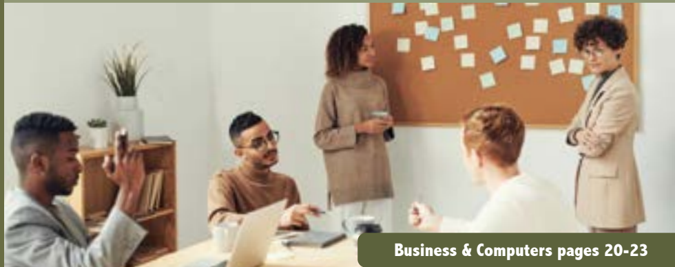
Business &amp; Computers pages 20-23